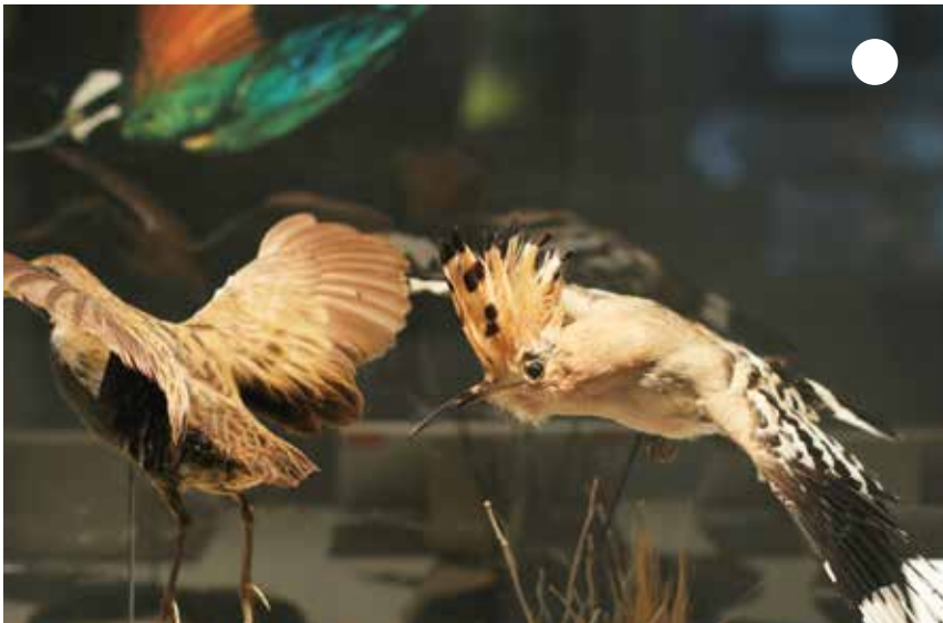
Learn about different birds