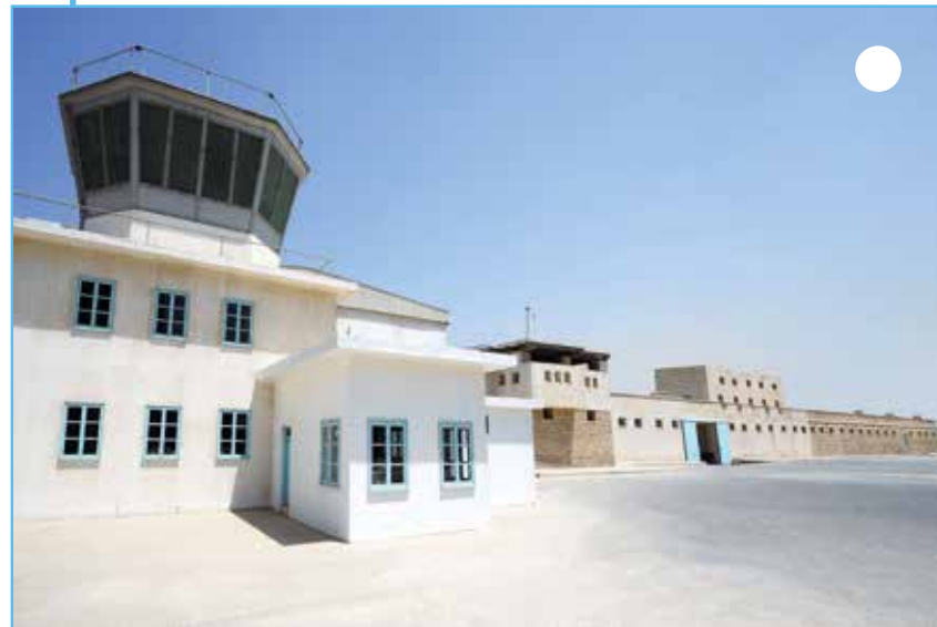
A Trip to Al Mahatta Museum