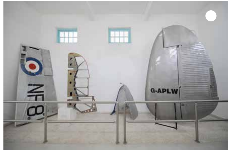
Learn about the different airplanes parts parts