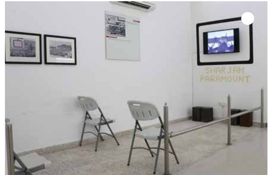
Learn about the first cinema in the Arabian Gulf