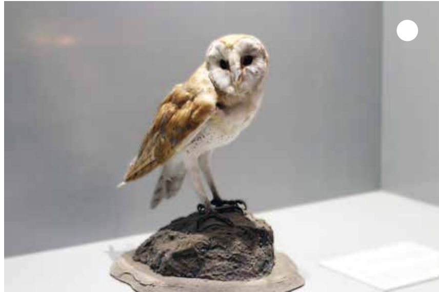
Learn about the white owl