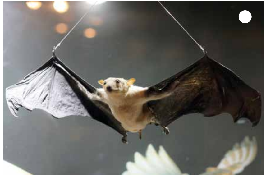
Discover flying mammals like bats