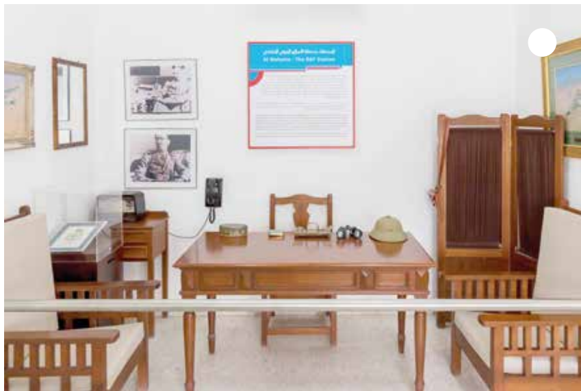
Learn about the Station Manager's office