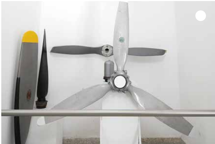
Discover the plane propeller