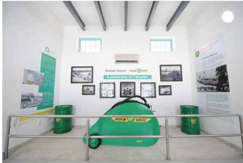
Learn about planes fuel station