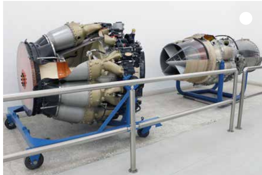
Watch the plane engine