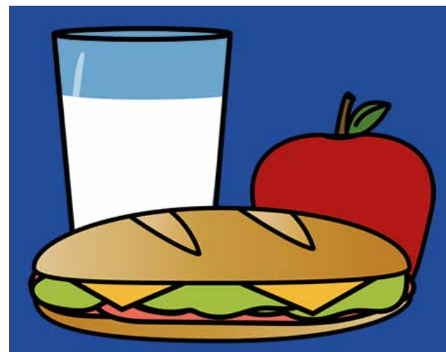
Eat and drink